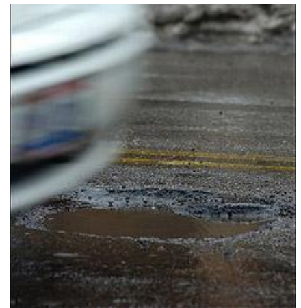
Watch for water-filled potholes. They may be deeper than you think.

If you are unsure if your suspension has been damaged, bring it in and we will be happy to help you determine if your vehicle has undergone any suspension damage.